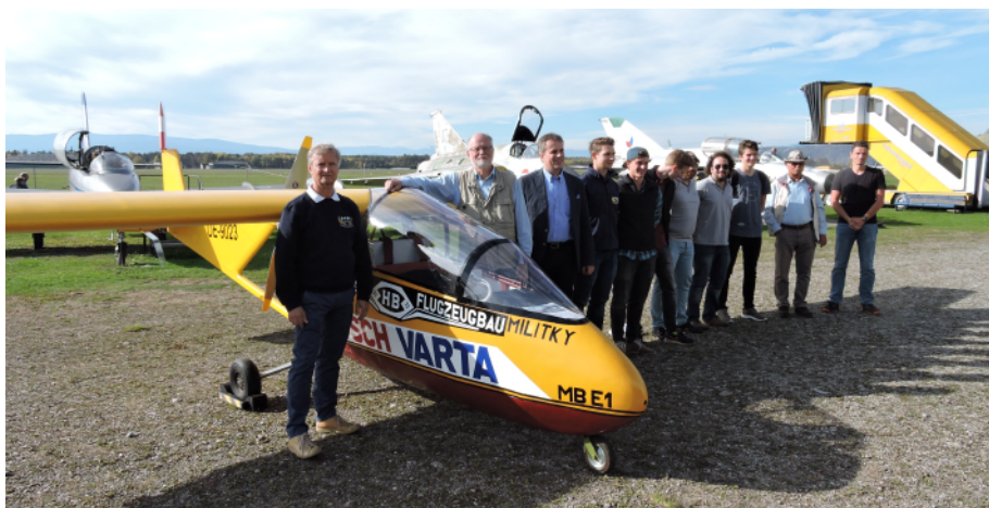
Team of Aviation section at the FH-Johanneum University of Applied Sciences in Graz, Austria, restored the MB-E1